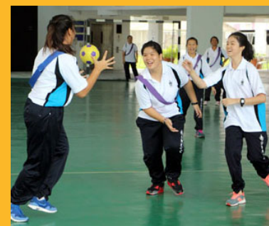
By Mr He Junhao

During the course of the visit, the SACSS students were surprised to discover the vast differences in the educational experience of their counterparts from a school that is located just across the causeway. They also found that they shared common interests, challenges and purpose in pursuing their studies. Most of all, they found joy in knowing that they are part of a big family of schools anchored by Canossian values.